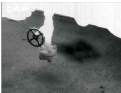
Methane leak at natural gas production site