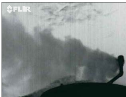
Venting pressure relief valve on storage tank

The GFx320 visualizes incredibly small hydrocarbon gas leaks with the sensitivity needed to comply with the US EPA's OOOOa methane rule. Surveyors can use the GFx320 to scan large areas and check thousands of components over the course of one inspection. The digital camera and automatic GPS tagging ensure you'll meet reporting requirements without the need for extra equipment. By fixing gas leaks quickly, you can save your company thousands in lost gas and lost profits while improving regulatory compliance and protecting the environment.