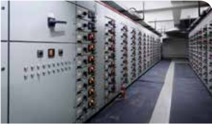
Constantly Monitor Critical Equipment

Combining thermal and visual cameras in a small, affordable package, the AX8 measures only 54 x 25 x 95 mm, making it easy to install in space-constrained areas for uninterrupted condition monitoring of critical electrical and mechanical equipment.