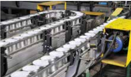
Peace of Mind in Manufacturing