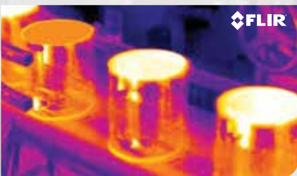
Spot Heat Variance Quickly